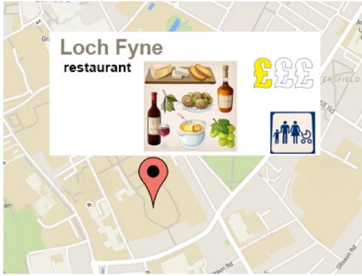
Figure 1: Pictorial MR for Table 1.