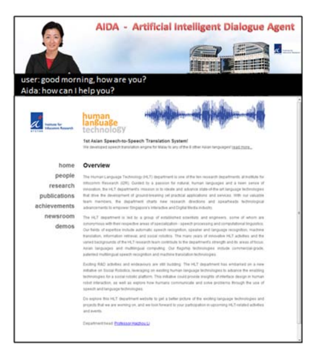
Figure 2: AIDA's output interface.

Figure 2 illustrates the main output interface of AIDA.