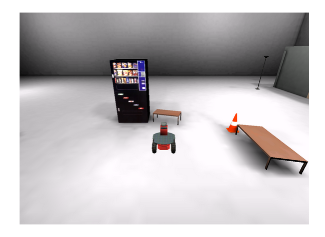
Figure 1: An example trial where the operator's command was "Move to the table". In red is the robot ( centered ) pointed toward the back wall. Participants would listen to the operator's command and enter a response into a text box.

In this study, participants came up with phrases that a search-and-rescue robot should say in response to an operator's command. The participant's task was to view scenes in a virtual envi-