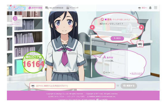
©Tsukasa Fushimi/ASCII MEDIA WORKS/OIP2 ©BANDAI NAMCO Entertainment Inc. Copyright©2017 Live2D Inc.