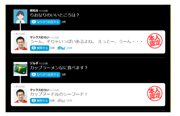
Figure 2: Web site for Max Murai.