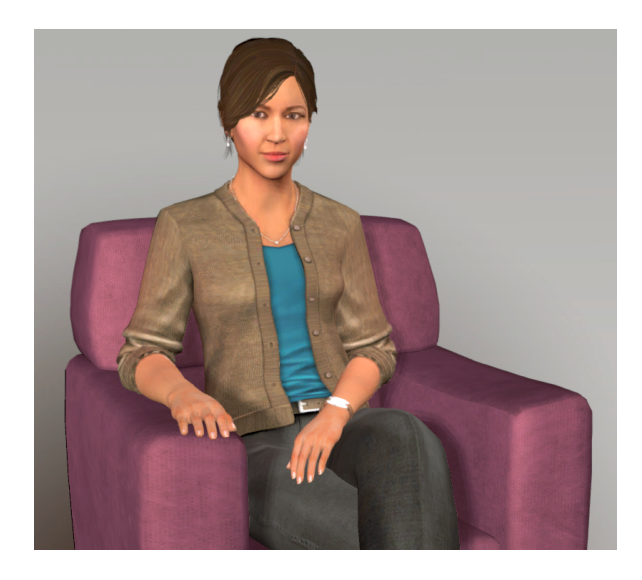
Figure 1: Ellie.

communicative behavior of patients with specific psychological disorders such as depression. In this section, we briefly summarize some closely related work.