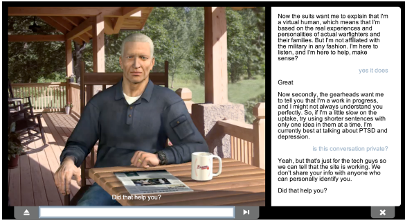
Figure 2: The interactive virtual human character published to the web, accessible by current browsers.